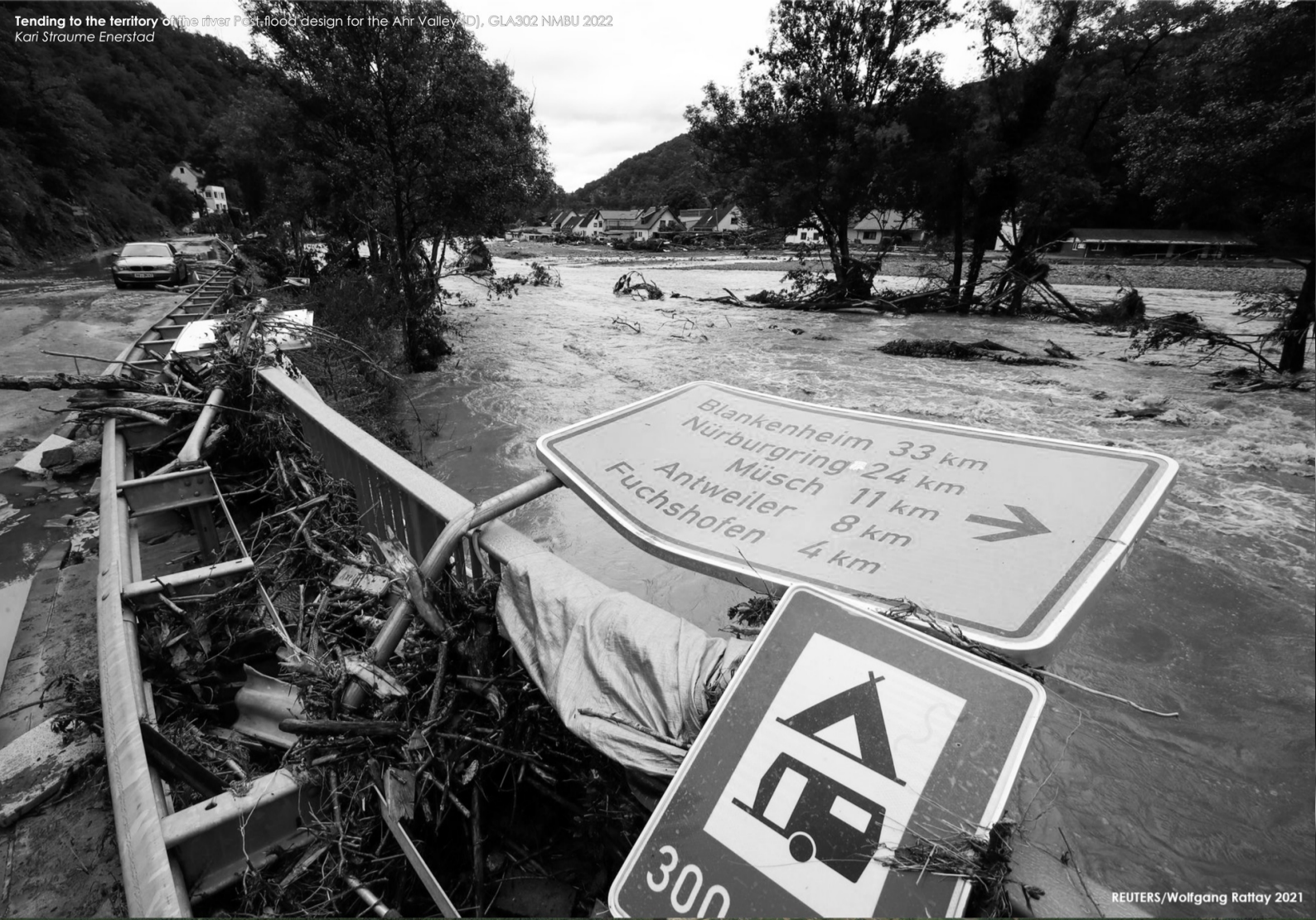
REUTERS/Wolfgang Rattay 2021