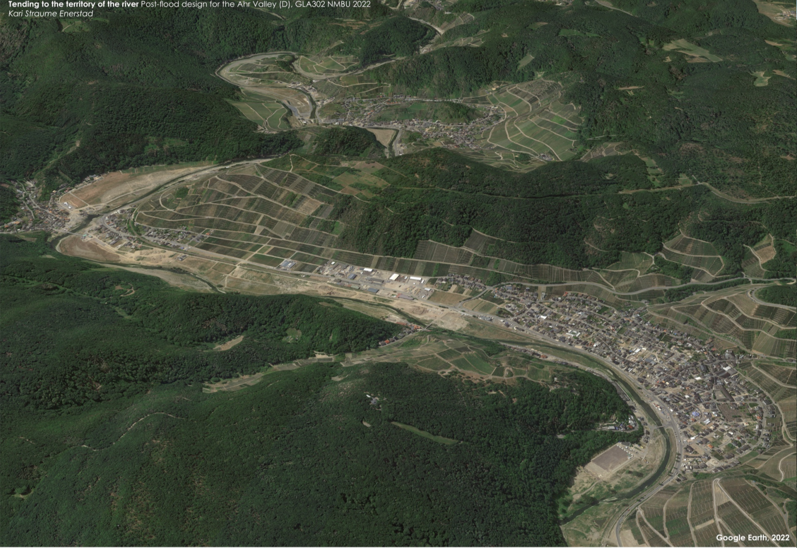
Google Earth, 2022