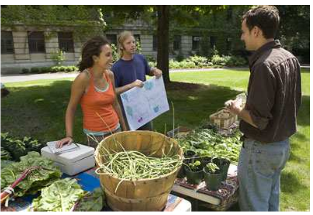
Student-run organic farm host weekly farmer's Market on campus