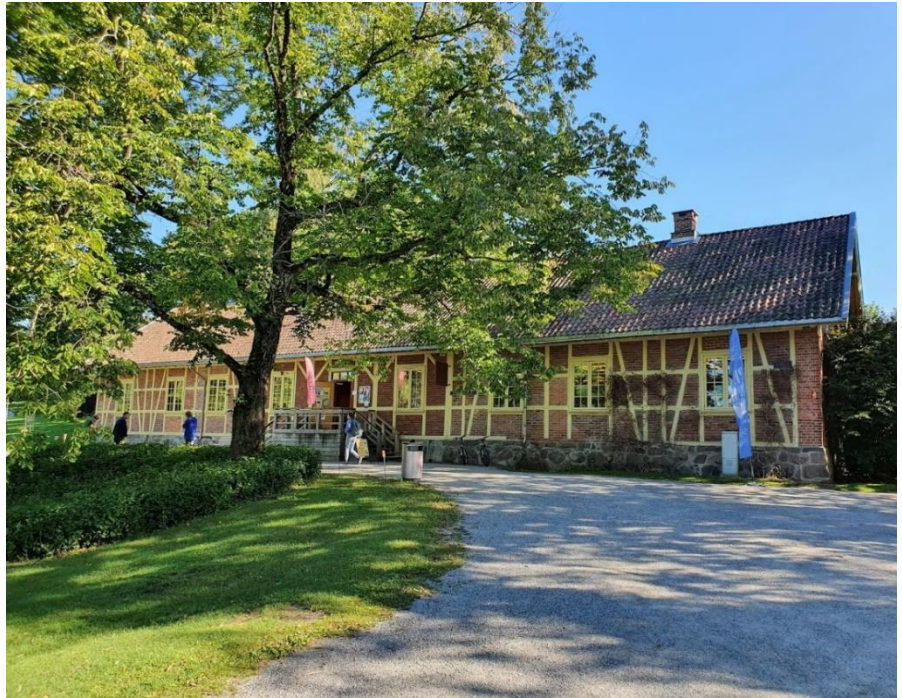
The SiÅs Housing Office and Boksmia (university bookshop) are housed in the above building which is located next to the duck

If you will be living on campus, you must arrange to pick-up your keys from the SiÅs Housing Office. The office is located next to the duck pond as shown on MazeMap . Regular office hours are between 10:00 – 15:00 during weekdays. You can email them at utleie@sias.no with your arrival date and time. If you are arriving after hours, they will provide special instructions for how to pick-up your keys. Remember to inform SiÅs of your time of arrival.