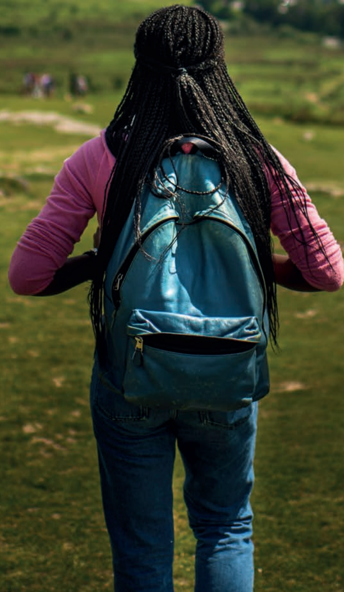
Dartmoor National Park, Devon