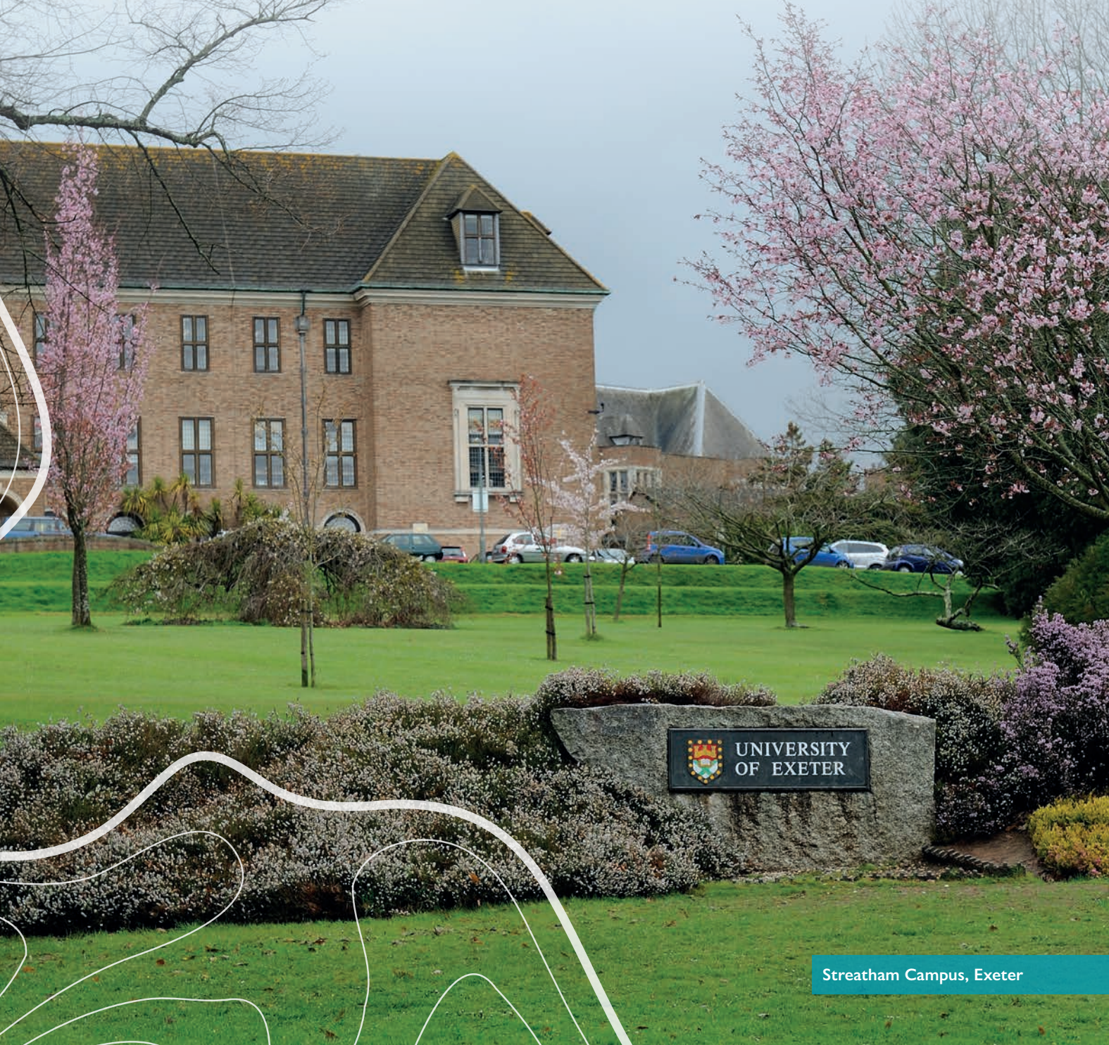
Streatham Campus, Exeter