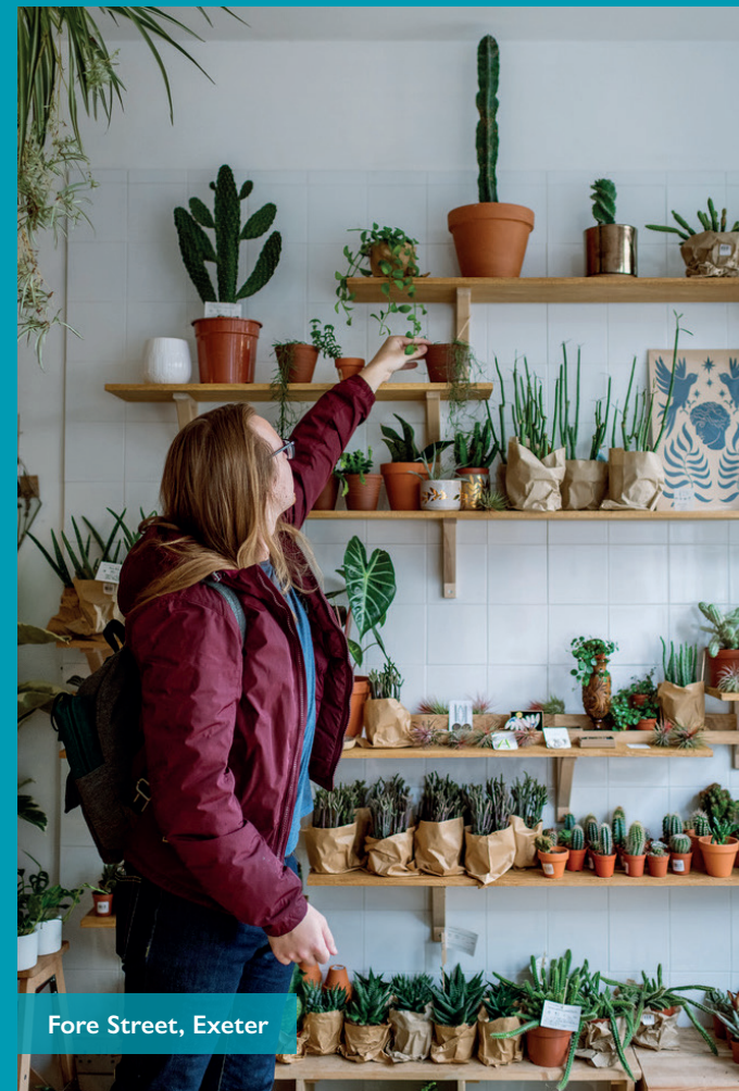
Fore Street, Exeter