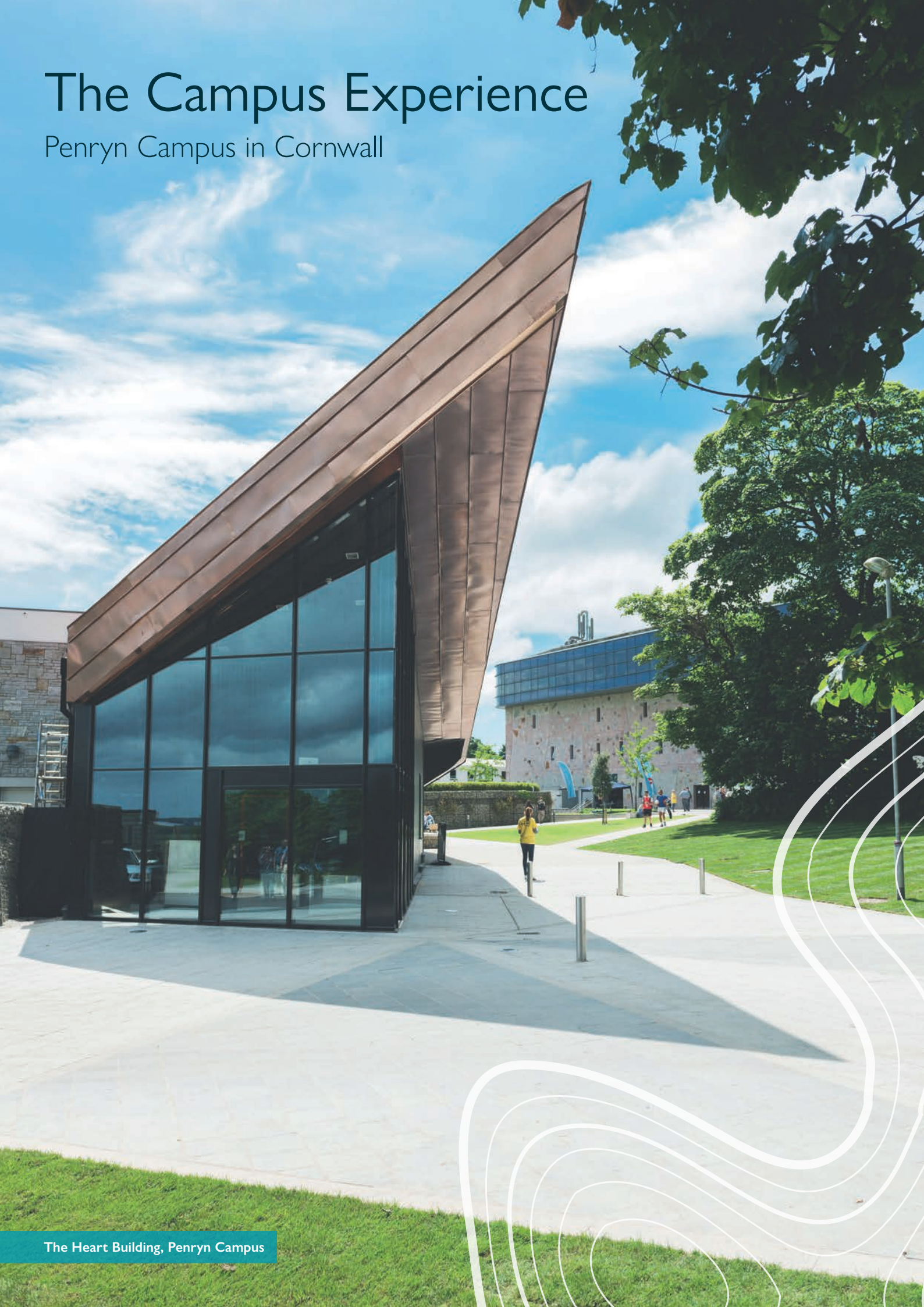
The Heart Building, Penryn Campus