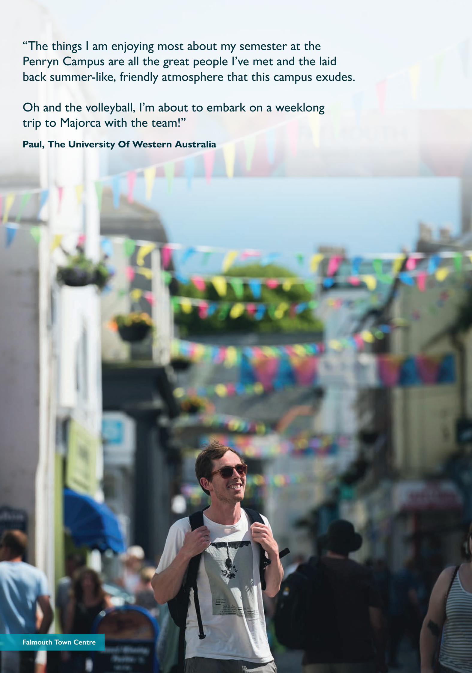
Falmouth Town Centre