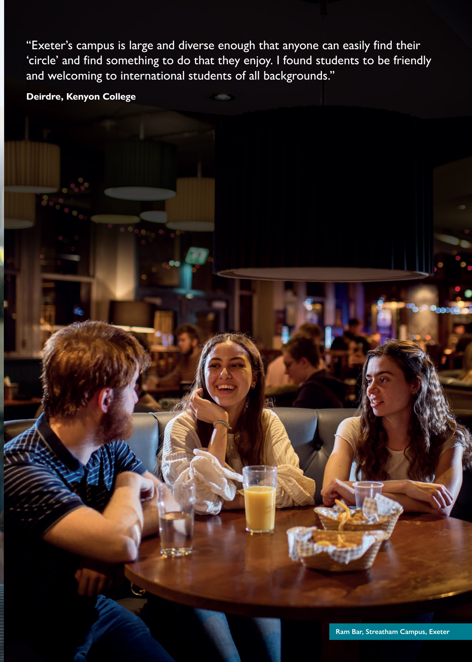
Ram Bar, Streatham Campus, Exeter