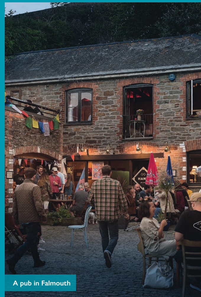
A pub in Falmouth