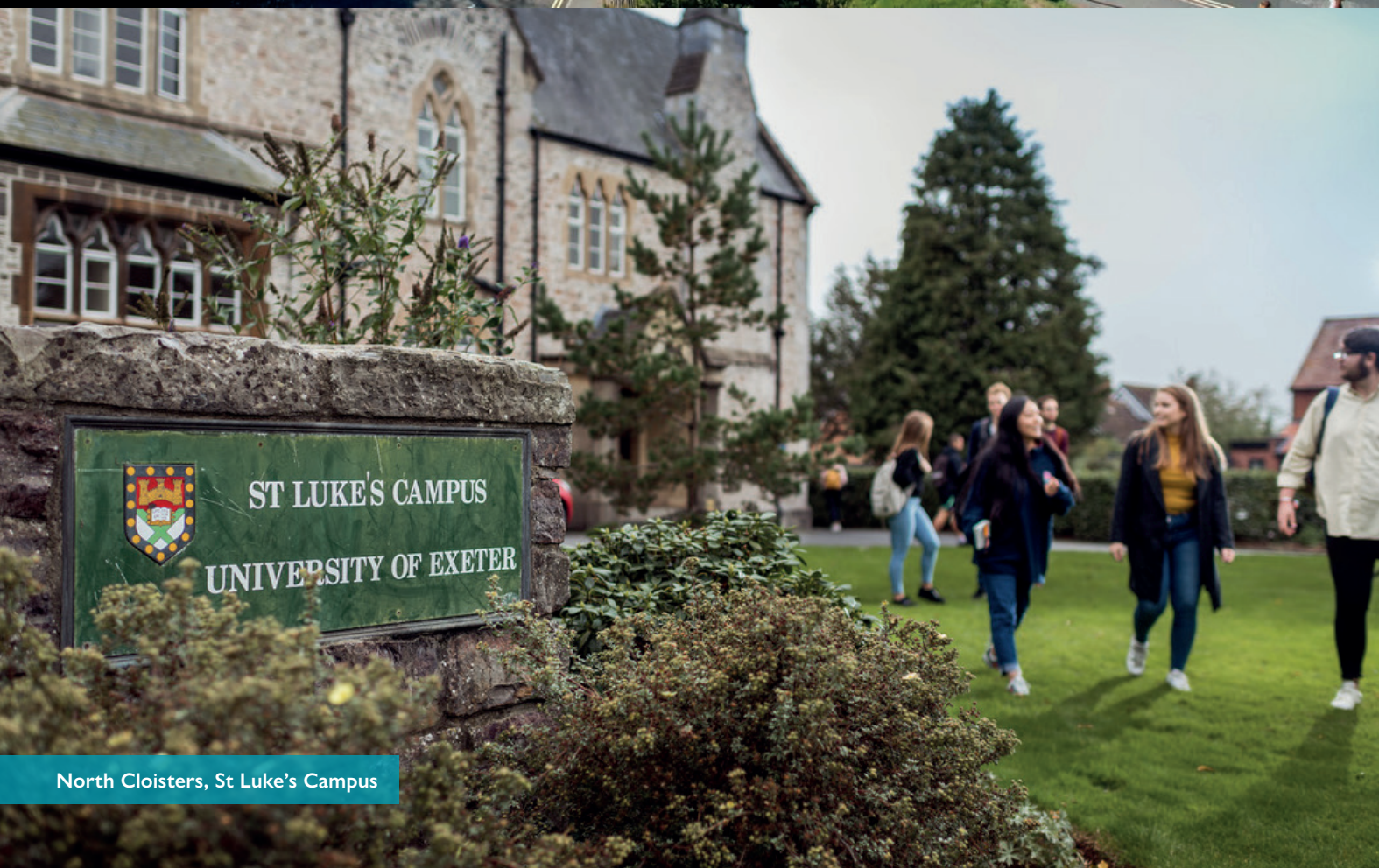
North Cloisters, St Luke's Campus