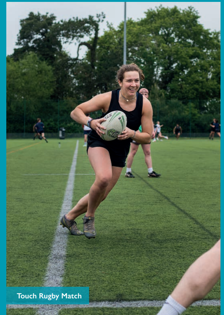
Touch Rugby Match