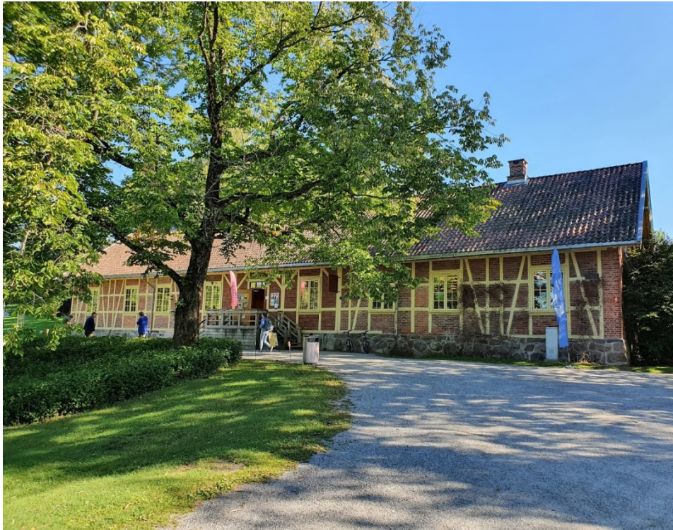
The SiÅs Housing Office and Boksmia (university bookshop) are housed in the above building which is located next to the duck pond (not pictured here).