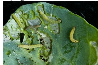
Fig. 3 Larvae of diamondback moth.

Thesis: Different approaches are relevant, and a specific approach must be made based on the student's field of interests. The master thesis will be a part of the projects Pesticide resistance: Mutation, selection and dispersal (RESISTOPP) 2017-2021 or Pesticide resistance: Preparedness and anti-resistance strategies (2017-2019).