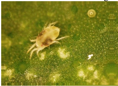
Fig. 1. Adult and egg of two-spotted spider mite

Background: Pesticide has become an increasing problem in Norwegian agriculture. Insect and mite pests of concern are the e.g. pollen beetles ( Brassicogethes/ Meligethes spp.) and flea beetles in oilseed crops, diamondback moth ( Plutella xylostella ) in cruciferous crops and two-spotted spider mite ( Tetranychus urticae ) in soft fruits berry production. Some populations of these pests have developed resistance towards one or more pesticides. In order to obtain less and a more sustainable use of insecticides, and reduce the risk of resistance development, there is a need to develop resistance management strategies for use at farm and district level, and to include anti-resistance strategies in integrated pest management programs.