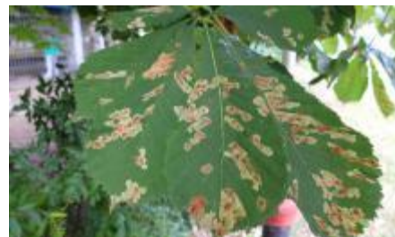
Fig. 2. Leaf mines made by larvae of horse-chestnut leaf miner

Thesis: Different approaches are relevant, and a specific approach must be made based on the student's field of interests.