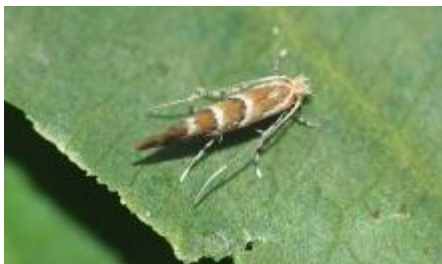
Fig. 1. Adult horse-chestnut leaf miner

Background: The horse-chestnut leafminer ( Cameraria ohridella ) was first described in Macedonia in 1984, it then spread rapidly across Europe. The larvae, mining in the leaves, has caused considerable damage on horse-chestnut trees since the 1980's. The horse-chestnut leaf miner was found for the first time in Drøbak in Norway in 2013, and has so far been found at several locations around Oslofjorden, including in the park at NMBU, and at one location in Vest-Agder. There is little experience on the biology and ecology of this pest in Norway, and how this pest can be managed.