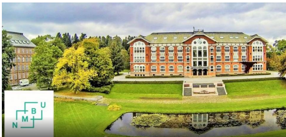
NMBU - Autumn 2021 Incoming International Students

Each semester a Facebook group is created for incoming international students. In the autumn semester, members in the closed group are both degree and exchange students. In the spring semester, only exchange students are members.