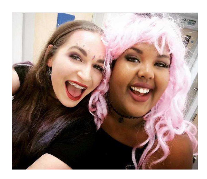
Interpol Halloween party

Aberystwyth has over 50 student clubs, that cater to almost hobby, sport and interests. All the societies' hold social events weekly that usually involve going into town for a night out with over 50 bars to choose from. I joined the Interpol society, as it was specific to my department and studies. They had weekly themed nights out such as Halloween, pub golf, formal wear, white-shirt etc in addition to academic events and games. The Erasmus exchange society collaborating with the international office had a few events throughout the semester for the incoming international students. From those there was a Canadian and American thanksgiving as well as an end of year Christmas party. Overall even though Aber is a small town, there is always something going and it was a great time. I met great friends that were a great support network both in class and outside. Overall I had a memorable experience on my exchange semester in Aberystwyth, Wales.