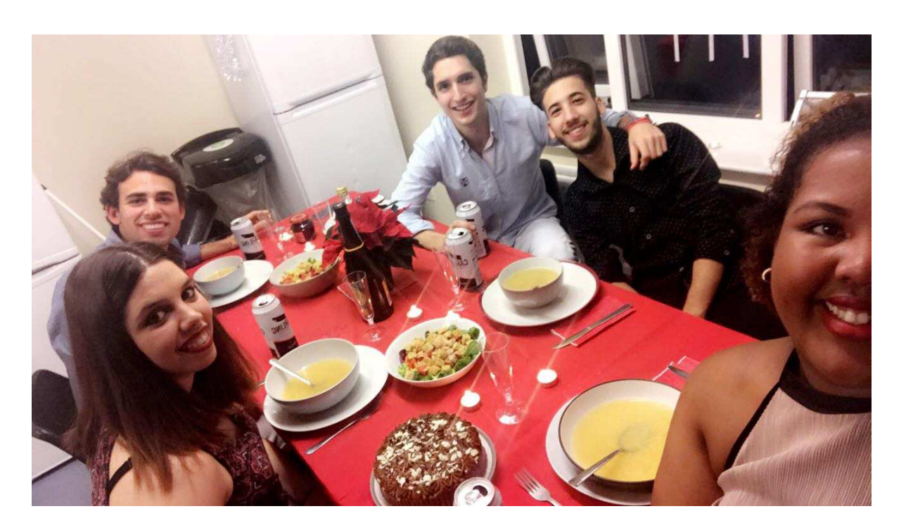
Flatmas with my flat mates from spain and greece