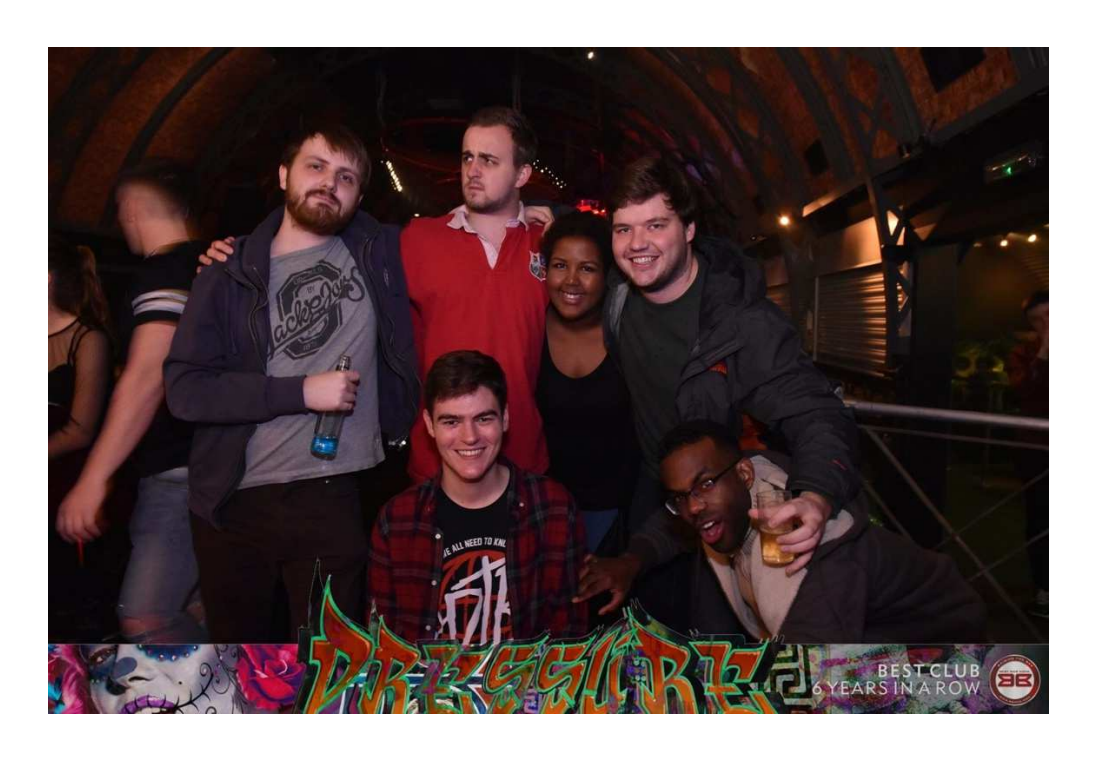
Social night out with my classmates from the USA and England