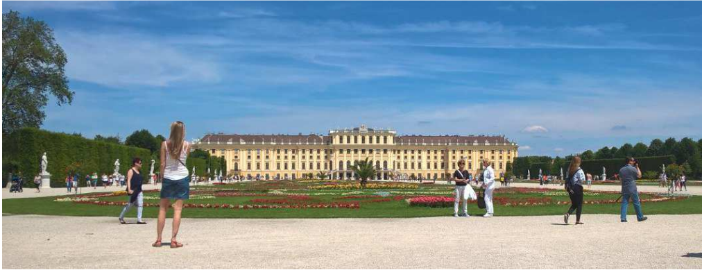
Figure 2: Schloss Schönbrunn - former home of Empress Sissi

Vienna is a beautiful city with many historical buildings; wondering around in the castles Hofburg or Schönbrunn , drinking coffee and eating a typical Apfelstrudel in the Café Hawelka or the famous Café Central, could already fill a day. But also the museums and theaters have much going for. I enjoyed many of these cultural offers, especially because they often had student discounts, which made the cultural experiences affordable.