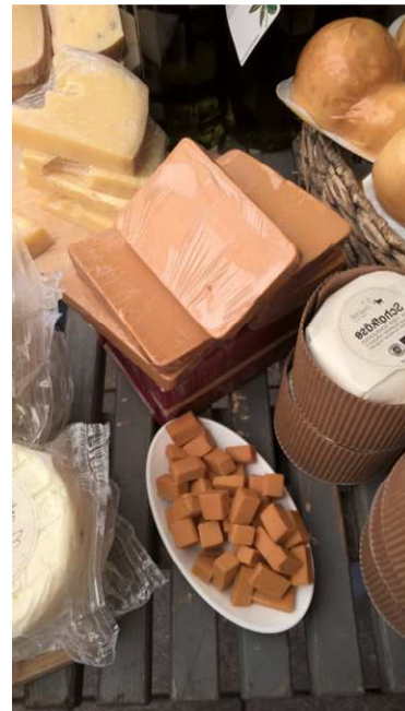
Figure 3: In order not to get homesick as Norwegian student in Austria, there is even Brunost at the Kutschkermarkt :)

Especially in the warmer months, the Donauradweg for cycling and a swim in the Donau around the Donauinsel is to recommend.